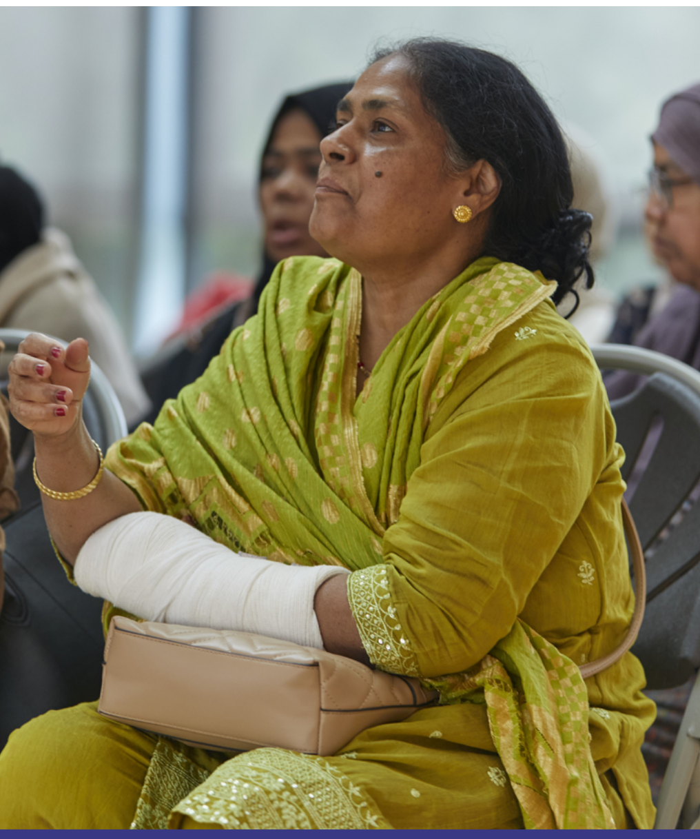
Islington Bangladesh Association Community Health Project

1 Grant funding of £44,000 was written back to the Health Grants programme during the year and became available for recommitment through the programme.